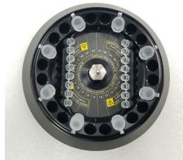
Figure 2 Balanced rotor load

Tubes to be loaded should be filled equally by eye. The difference in the weight between the tubes should not exceed 0.1 gram. Tubes should always be loaded so that there is equal spacing between all tubes. One or two additional loaded tubes may need to be added to achieve this.