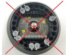
Figure 3 Incorrect rotor load