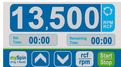
Figure 1 CENTRY™ 117 Microcentrifuge control panel layout

The speed (rpm or g-force) can be selected from 1,000 to 13,500 rpm or from 100 to 16,800 x g by touching the speed display and adjusting with the up and down arrow buttons. Display of rpm/rcf can be toggled with the rpm/rcf button on the display.