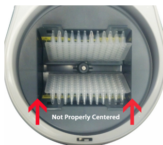
Figure 2 Example of Improperly Balanced Rotor